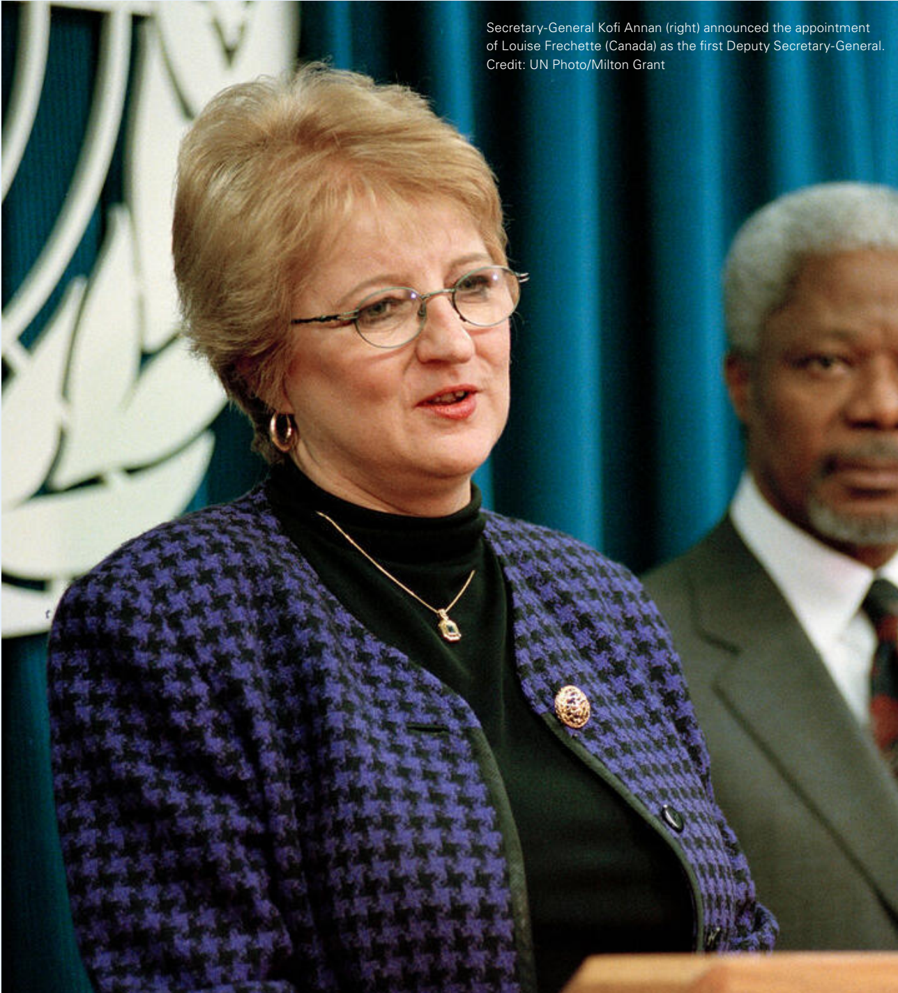
Secretary-General Kofi Annan (right) announced the appointment of Louise Frechette (Canada) as the first Deputy Secretary-General.

Assembly appoints a new Secretary-General. Of course, the DSG would only be able to serve as Secretary-General ad interim until the expiration of the Secretary-General’s term of office, as stipulated in the appointment (or reappointment) resolution passed by the General Assembly.