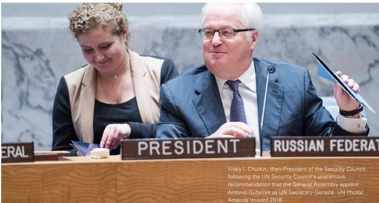
Vitaly I. Churkin, then-President of the Security Council, following the UN Security Council’s unanimous recommendation that the General Assembly appoint António Guterres as UN Secretary-General. UN Photo/ Amanda Voisard 2016