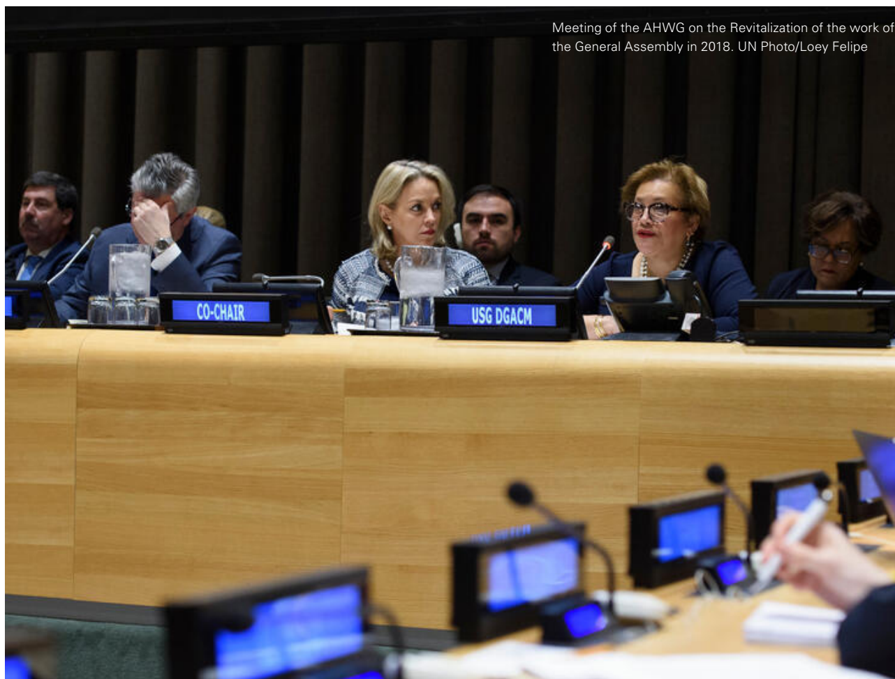
Meeting of the AHWG on the Revitalization of the work of the General Assembly in 2018.

The 10 reform opportunities for the General Assembly’s consideration are outlined on the following pages.