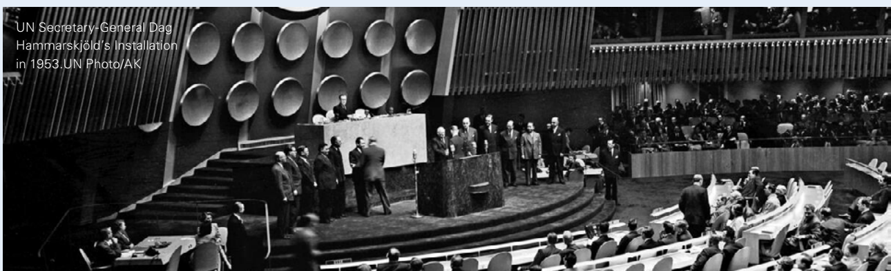
UN Secretary-General Dag Hammarskjöld's Installation in 1953.

One of his close advisors described it as “leaving an aching void at the United Nations”. 22 Leadership during the six-week period between Hammarskjöld’s death and U Thant’s appointment as Acting Secretary-General was ad hoc, with senior officials close to the former SG, including Ralph Bunche, Andy Cordier and Brian Urquhart taking the reins (without any formal investiture of the Secretary-General’s power). 23 More generally, relevant under-secretaries-general retained authority over their own “ sphere of competence ”. Cordier resigned the following year amid Soviet allegations that he had been trying to run the United Nations singlehandedly.