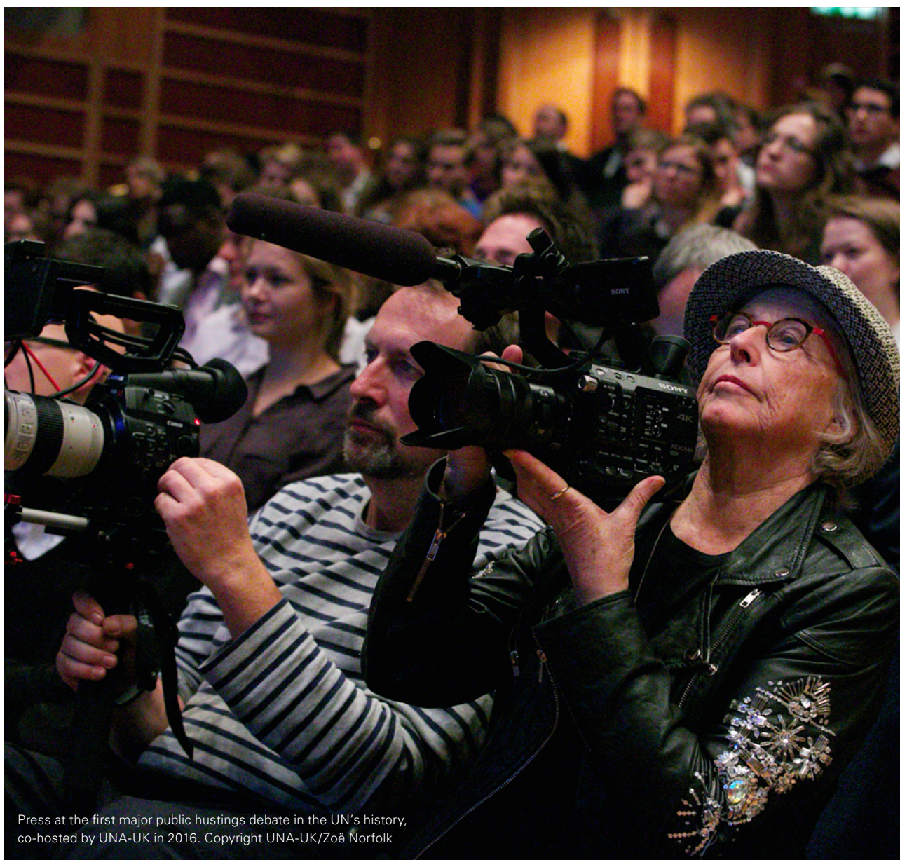
Press at the first major public hustings debate in the UN's history, co-hosted by UNA-UK in 2016.

UNA-UK's briefing on reform proposals for civil society inclusion in General Assembly processes is available on demand – please contact info@una.org.uk